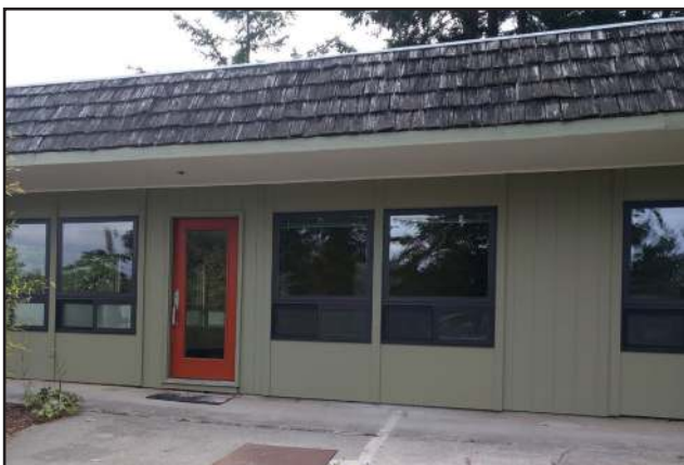
Urner Street Building

In order to make several needed upgrades, such as new windows, roof, and heating systems, OICF committed part of Bob Henigson's legacy gift. We believe investing in the building would have been something Bob would have appreciated.